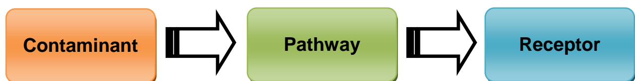
Figure 1.1: Contaminant Linkage

For a relevant risk to exist there needs to be one or more contaminant-pathway-receptor linkages (contaminant linkages) by which a relevant receptor might be affected by the contaminants in question. In other words, for a risk to exist there must be contaminants present in, on or under the land in a form and quantity that poses a hazard, and one or more pathways by which they might harm people, the environment, or property; or significantly pollute controlled waters.